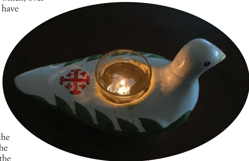
This oil lamp is a gift the parish of Beit Sahour made to the Grand Master and will burn in his chapel until there is peace in the Holy Land