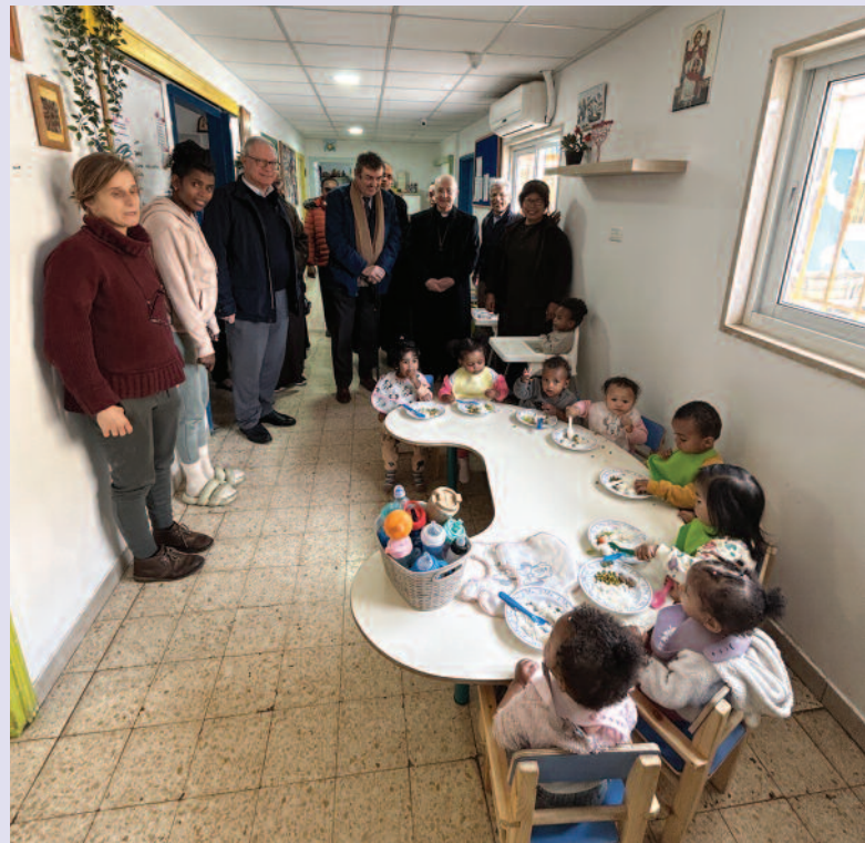
Visit to the Saint Rachel Center in Jerusalem, which is part of the Vicariate for Migrants and Asylum Seekers.

A visit by the Vicariate for Migrants and