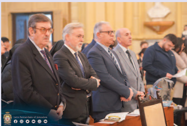
Mass for the World Day of Peace, on the feast of Mary Mother of God, was concelebrated by the Grand Master in the Pro-Cathedral of the Latin Patriarchate in Jerusalem.

In the afternoon, the delegation participated in the traditional daily procession organized by the Franciscan friars to the Basilica of the Holy Sepulchre, on the Sites of the Passion, Death and Resurrection of the Savior. Humbly, among the few pilgrims present – with a lit candle in his hand – Cardinal Filoni meditated at the foot of Calvary, near the stone where the body of the Crucified One was anointed, in front of the empty tomb and at the spot, marked by a large circle on