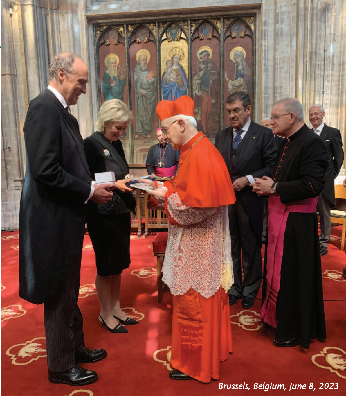
Brussels, Belgium, June 8, 2023